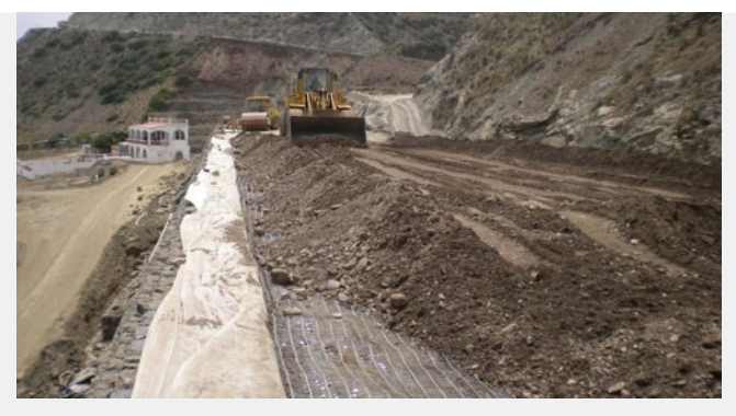
Levelling/compaction of the filling, gabions being used as well as temporary formwork, Enka-Tex pending layer on the gabions