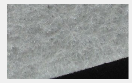
Enka-Tex® NW Needlepunched/thermally bonded geotextile for separation/filtration