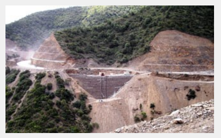
Enkagrid retaining solution minimised the load on top of the existing slopes

constructions were designed in accordance with the French design standard NF P 94-270 which follows the European regulation Eurocodes. Eurocodes establish a semi-probabilistic approach to safety while applying the principles of limit state calculation with partial factors for the justification of the reinforcing elements. In brief, the effects of loads on internal and external stability are determined through combinations of different permanent or temporary loads in different seismicityor accident-related scenarios, to ensure stability under the most challenging circumstances.