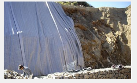
Enkadrain in very aggressive conditions of use (tensile strength and puncture resistance)