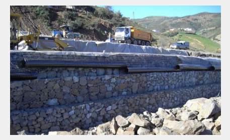
Enkagrid layers pending the levelling and compaction of soil layer