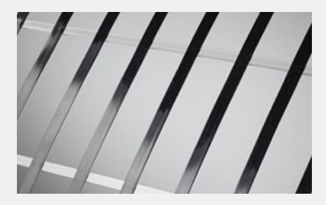
Enkagrid® PRO Uniaxial geogrid with laser welded straps for soil reinforcement