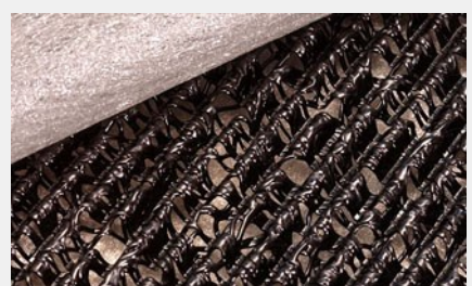
Enkadrain® Wide Drainage geocomposite with V-shape monofilament structure