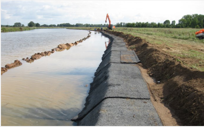
Situation after installation