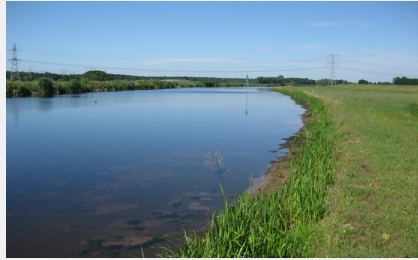
Situation in Summer the year after