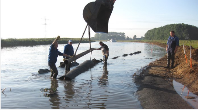
Installation in September