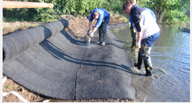
Easily cut to size