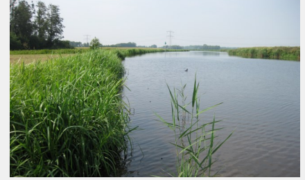
Well vegetated bank within two years time

Prior to the installation of Enkamamat A20, the banks of the "Oude IJssel" were re-profiled and provided with a kind of water-side puddle. Apart from the grass seeds, also reed-rhizomes were spread in the puddle to create a fine reeds vegetation.